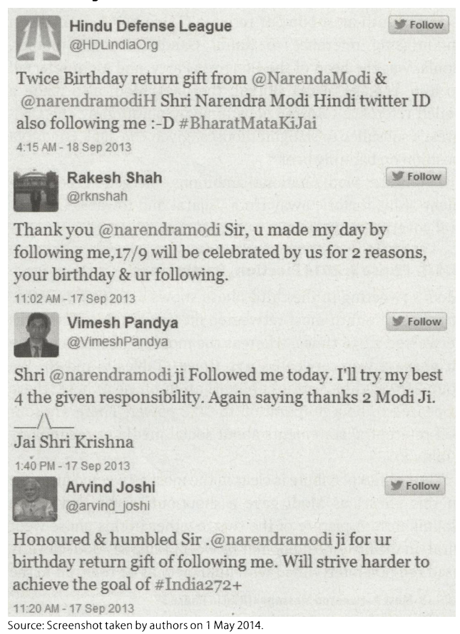
Figure 2: Public Profiles of Twitter Accounts That Mention Modi Following Them

Two categories with low coefficients of variance—youth and development—were consistently tweeted themes in all phases. Political themes such as elections, as well as issues relating to Modi's own party, the BJP, and the rival Congress Party appear relatively more selectively. Elections are strong in phases 2 and 3, and in the run-up to the general election, rallies, addresses, and political confrontations are very strong. These drop off in phase 4. His home state of Gujarat, a major theme in the first two phases, declines later. The Hinduism theme, represented significantly during the first and second phases, drops off leading up to the elections (Table 4).